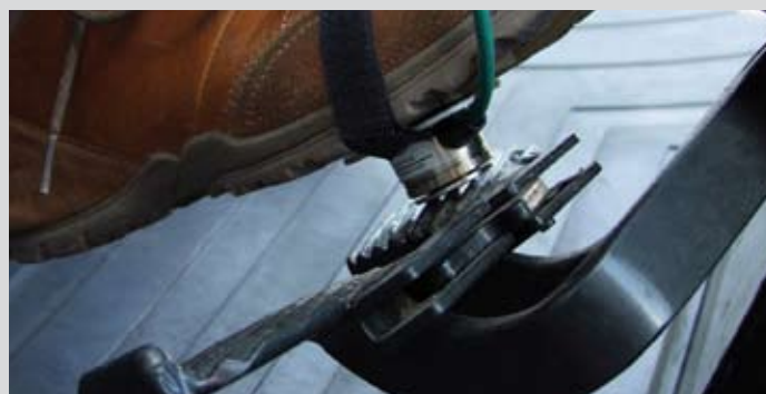
Additional recording of measured values through the pedal force sensor during brake testing.