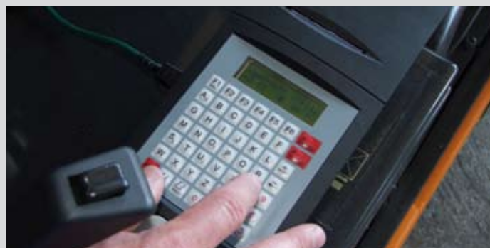
Simple and clearly arranged user interface through menus displayed on the LCD display.