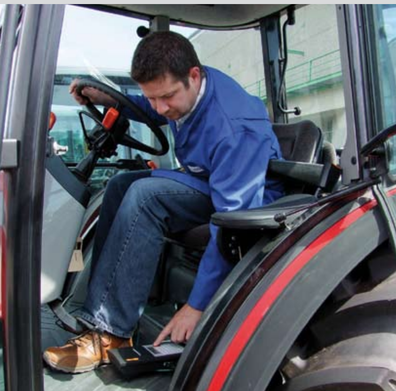
For the measurement, the VZM 300 decelerometer is simply laid down on the floor in the vehicle.

The decelerometer VZM 300 was developed specially for the measurement of brake decelerations during effectiveness tests on brake systems of vehicles and trailers in agreement with statutory requirements. It convinces through a number of useful functions and an attractive price. In addition, it offers the possibility, through the connection of different external sensors (brake pressure, pedal force etc.), to simultaneously display further parameters in order to assess the respective measurement.